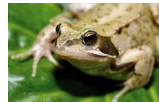
Canon Macro Ring Lite MR-14EX