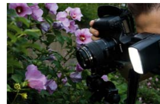
Canon Speedlite 580EX

We have not included the Canon Macro Twin Lite MT-24EX in these tests as, although very versatile, it is not a true ring flash.