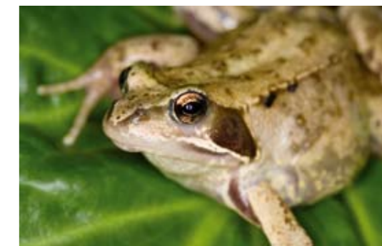
Canon Speedlite 580EX with Ray Flash Adapter