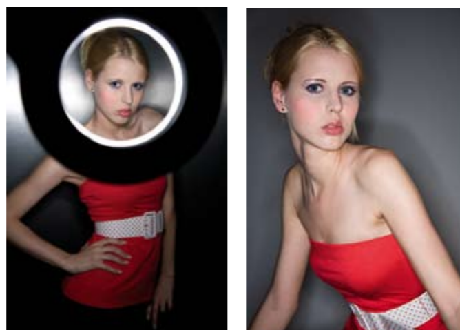
Top Small and light, the Ray Flash Adapter is perfect for portraits.